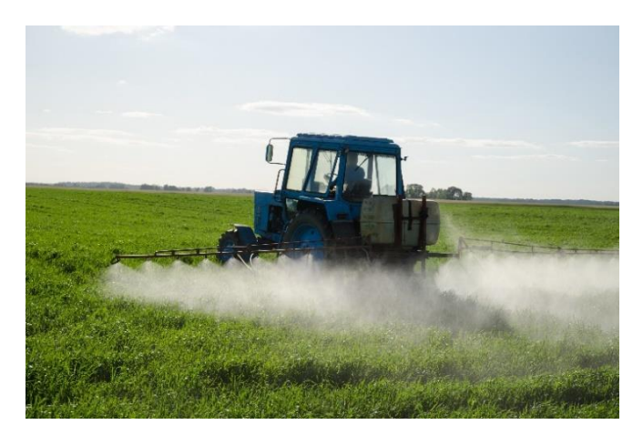
Pesticides often contain endocrine disrupting chemicals

Over 1400 compounds are suspected or known to have endocrine disrupting properties for wildlife or humans (12). Some of these are known to be detrimental to human health (5).