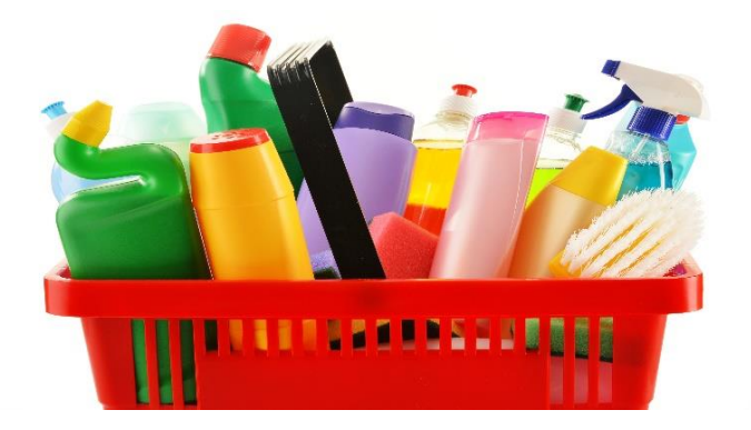
EDCs are found in a range of everyday products

Breast Cancer UK is working with partners in Europe to press for a robust and comprehensive EDC strategy which promotes the phase out of potential and suspected EDCs and their replacement with safer alternatives. See our <u>EDC</u> <u>Policy page</u> for more on our work in this area.