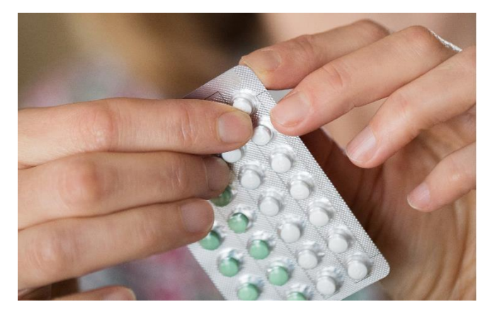
HRT contains synthetic hormones that can increase breast cancer risk

Hormones other than oestrogen, such as progesterone, prolactin and testosterone, can also affect breast cancer risk (27). EDCs which affect pathways associated with these hormones may also affect risk. The UV filter benzophenone-3 is an oestrogen mimic suspected of increasing breast cancer. This compound is also an androgen agonist and affects progesterone receptor function (43).